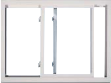
2-Lite Slider Window