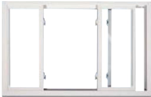
3-Lite Slider Window